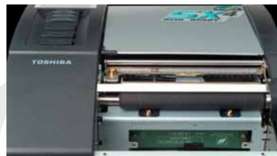
UHF RFID Antenna ↑

UHF 869.5 The B-9704-U1-QP option enables the printer to encode chips at 869.5 MHz. Current supported chips are EPC Class 0, Class 1 and ISO-18000-6-B. EPC Class 0+, GEN2 will be available in the near future.